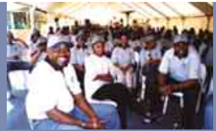
Staff members at the Gaborone Mompoti Celebration

The celebrations were not confined to Gaborone. All across the country, simultaneously, on August 7th staff celebrations took place. Venues were Maun, Selebi-Phikwe which catered for Francistown and Palapye as well and Gaborone which also catered for Lobatse. The atmosphere was informal and the guest speakers encouraged the staff to keep up their good work and thanked them for 10 years of selling and servicing MOMPATI.