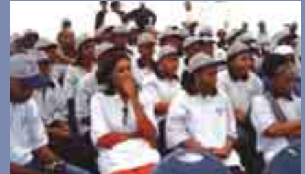
Staff members at the Selebi-Phikwe Mompoti Celebration