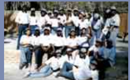
Staff members at the Maun Mompoti Celebration